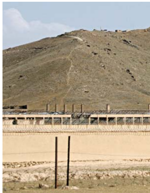
The Salt Pit (Shomali Plains northeast of Kabul, Afghanistan).

If we accept Marx's argument that a fundamental characteristic of human existence is "the production of material life itself" (that humans produce their own existence in dialectical relation to the rest of the world), and, following Lefebvre (and Marx) that production is a